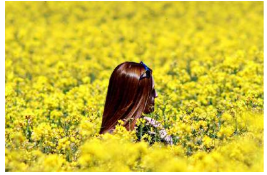
'Isolated' by Kenna Winter from 'no space, every place'

and blaze, blaze all night long for no one.