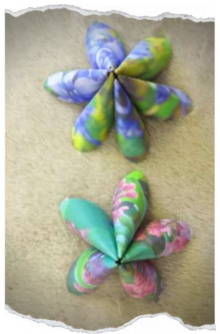
'Paper Nature' by Boo Green, from 'no space, every place'

CHECK OUT THE VIRTUAL GALLERY AND 'NO SPACE, EVERY PLACE' EXHIBITION AT YOUNGNORFOLKARTS.ORG.UK/VIRTUALGALLERY