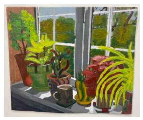
'The Windowsill' by Ciara Curzon from 'no space, every place'

The afternoon consisted of finding various spots around our garden to take similarly nature-centric pictures, all in the name of creative inspiration. It's fair to say, I really love my job. So when a writing workshop I attended a few days later turned out to be all about nature, I was ready.