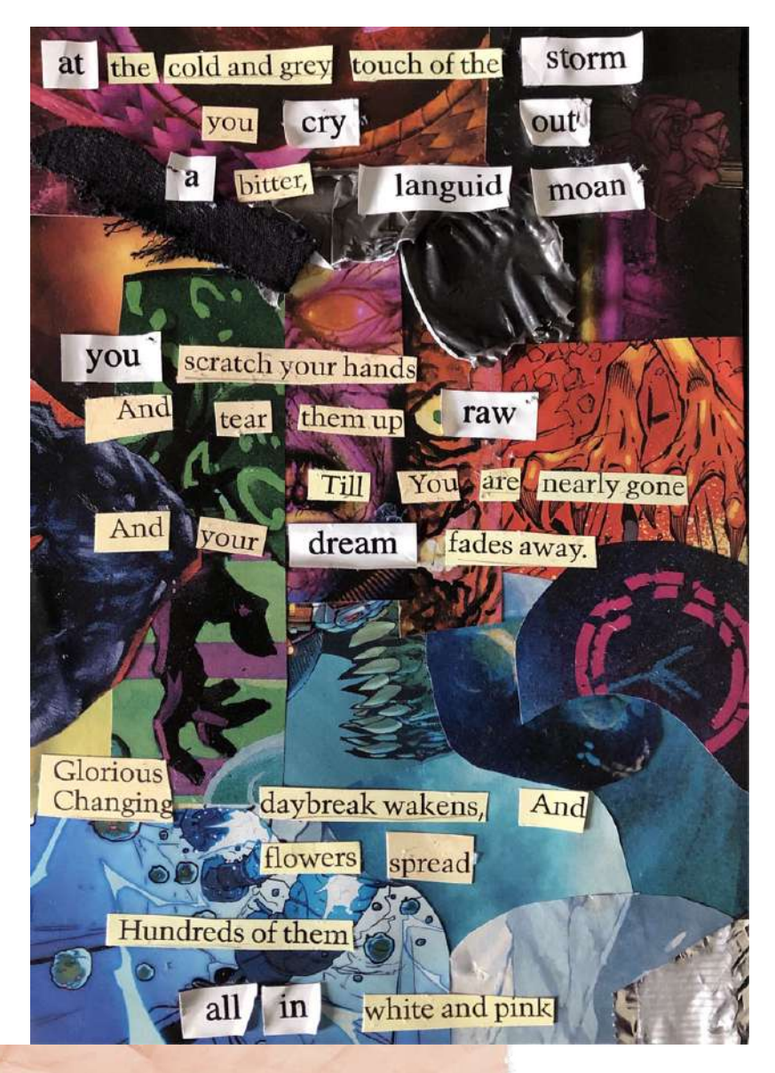
by Eli Court inspired by 'no space, every place'